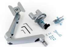
Single-to-Dual Conversion Kit

Allsteel Inc. Muscatine, Iowa 52761-5257