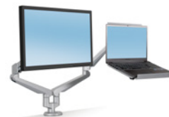
Adjustable Laptop Tray