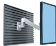
Tool Tile Attachment