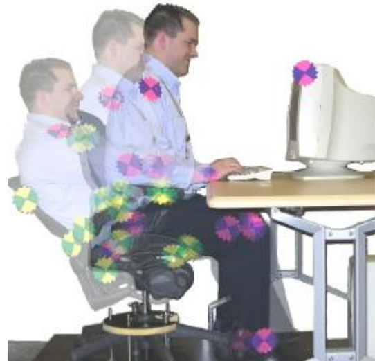
Figure 4. Other chairs do not allow the eyes and head to work target when reclining. This uneven movement downward can cause problems with eye strain, glare from lighting, and muscle fatigue.

When reclining, the Sum chair users averaged 11.4" of horizontal movement from the upright position. The recommended range of distance from the monitor is 18-30", or a total of 12". The majority of the chairs tested had a total horizontal movement that fell in this range of 12". Other chairs varied between 7" and 19". The smaller movement during recline allows for better focus on the monitor and easier reach of the keyboard.