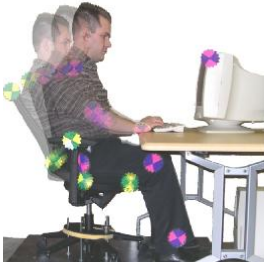
Figure 3. Using Avatar 2 technology, the Sum chair allows users to work target as they recline or sit up. The user's head does not drastically change position vertically or horizontally.

the monitor, and strain muscles as he or she tries to reach the keyboard and look upward toward the monitor.