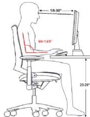
Figure 1. Ergonomic guidelines for individuals who are sitting encourage good posture to maximize comfort and minimize pain and injuries.

When working at a desk with a computer, it is important that the keyboard and monitor be placed at the correct height and distance. This will help to ensure appropriate posture for the arms, wrists, and